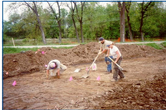
Phase III Archaeological Data Recovery