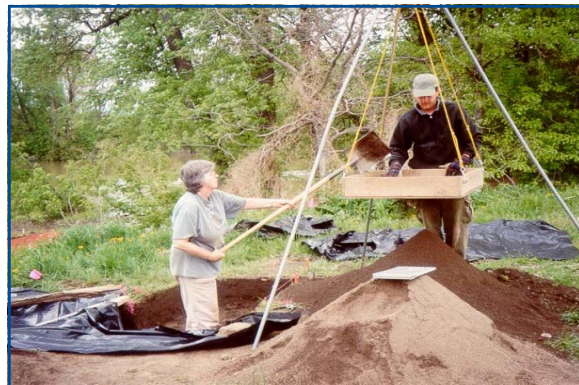
Phase III Archaeological Data Recovery